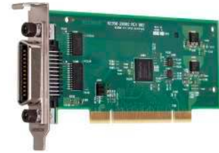
82350C with low-profile bracket