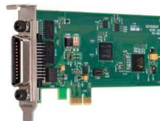
82351B with low-profile bracket