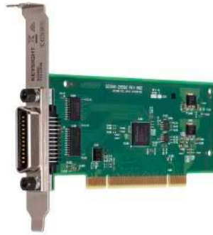
82350C with standard profile bracket

The 82350C interface card is fully compatible with IEEE-488 control and communication standard, de-couples GPIB transfers from PCI bus transfers. Buffering provides I/O and system performance that is superior to direct memory access (DMA). The hardware is software configurable and compatible with the plug-and-play standard for easy installation. The GPIB interface card offers high flexibility to plug into standard or low profile PC with a bracket change.