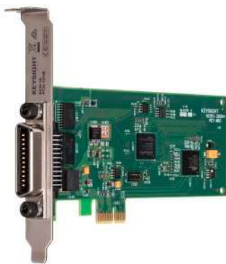
82351B with standard profile bracket

PCIe is the next generation of PCI and offers unsurpassed speed and performance, making PCIe cards an ideal choice for many computer platforms and automation applications. It is full backward compatible with PCI-configured software or coding, removing the need to reconfigure any code. The 82351B is highly flexible with plug-and-play configuration and enables usage in a low-profile PC with a bracket change.